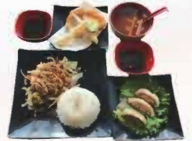
Rice set with Gyoza and Tempura