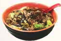
Beef Udon Soup