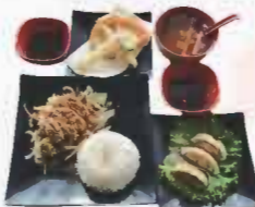
Rice set with Gyoza and Tempura